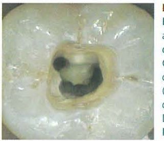
Figure 1. Endodontic access cavity demonstrating C-shaped configuration.

A C-shaped canal can lead to difficulties during treatment, so proper diagnosis is essential. A straight-on preoperative radiograph as well as additional angulated radiographs often provide clues about the canal morphology. Common radiographic characteristics of this entity are fused and conically shaped roots, a large distal canal, a narrow mesial canal and a blurred image of a third canal in-between. Radiographs taken while negotiating the canals may reveal 2 characteristics for such canal configuration: instruments tend to converge at the apex and/or may exit at